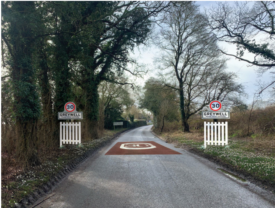
Mockup of Potential Gateway by Bethan Emerson

If you've shopped at Tesco in Hook you'll have noticed they have a guard at the door. Indeed, in response to the serious rise in shoplifting, guards at the door are a feature of supermarkets across the country. They don't totally prevent determined shoplifters but they make a difference.